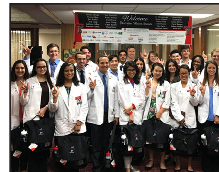
Sponsorships & presentations to Tech Health Sciences Center medical students and Permian Basin area nursing students

- 2020 - Nancy Rodman Anguish Legacy Fund added