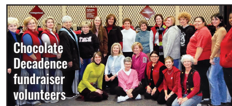
Chocolate Decadence fundraiser volunteers

- 2004 - First Introductory Course with 22 people